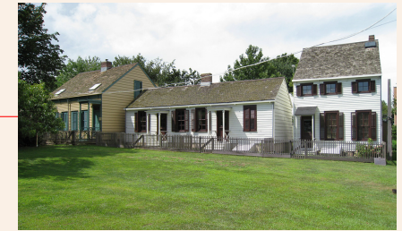
Hunterfly Road Houses