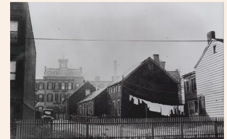
Hunterfly Road Houses, 1922